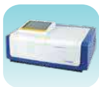
UV/VIS Spectro 2080+ Double Beam

Analytical Technologies is synonymous for offering technologies for doing analysis and is the Fastest Growing Global Brand having presence in at least 96 countries across the global. Analytical Technologies Limited is an ISO:9001 Certified Company engaged in Designing, Manufacturing, Marketing & providing Services for the Analytical, Chromatography, Spectroscopy, Bio Technology, Bio Medical, Clinical Diagnostics, Material Science & General Laboratory Instrumentation. Analytical Technologies, India has across the Country operations with at least 4 Regional Offices, 6 Branch Offices & Service Centers. Distributors & Channel partners worldwide.